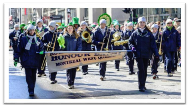
The RWA Honour Band participated in Montreal's 194<sup>th</sup> St. Patrick's Day parade on March 19.