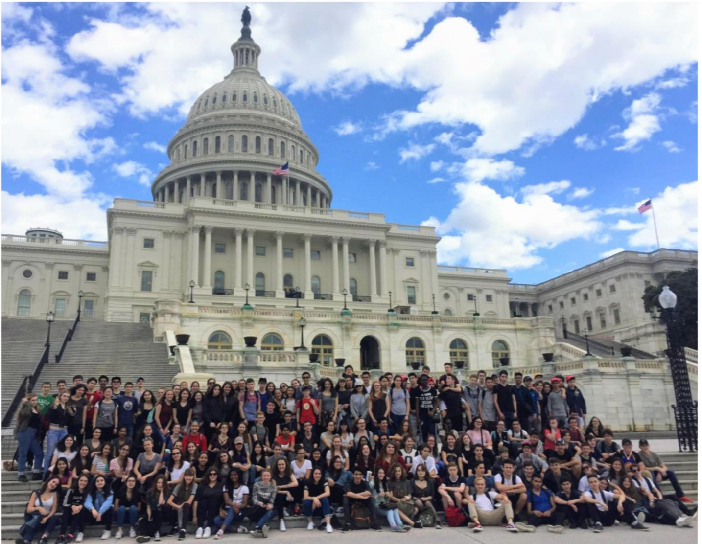
Secondary III students at the United States Capitol Building in Washington DC.

The experience of coaching a team was very different than what I expected it to be. Between planning the transportation for any “away” games and physically training the Secondary I boys during tiresome practices,